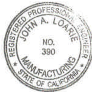
State of California Professional Engineering Stamp