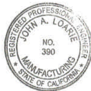
State of California Professional Engineering Stamp