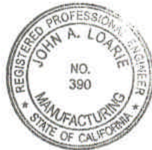
State of California Professional Engineering Stamp