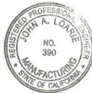
State of California Professional Engineering Stamp